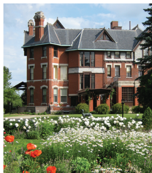
Cedar Rapids Museum of Art 319-366-7503